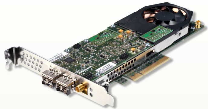
NT20E2: 2 x 10 Gbps PCIe Gen2

The NT20E2 Capture Adapters provide deep packet inspection (DPI), flow analysis, and protocol processing capabilities that can accelerate network applications and off-load the server CPU by taking care of layer 2 to 4 network traffic analysis. This enables OEM customers to build or upgrade their products to become high-performing full-line-rate 20 Gbps network monitoring/analysis systems by using the NT20E2 Capture Adapter and a standard Linux, FreeBSD, or Windows server.