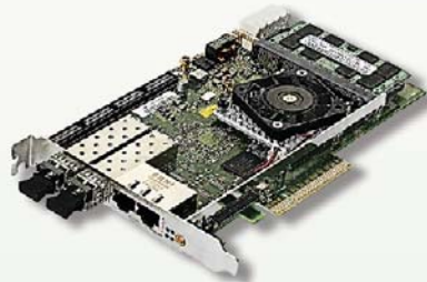
NT4E-2+2T: 4 x 1 Gbps PCIe