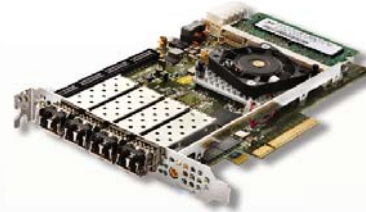
NT4E-4: 4 x 1 Gbps PCIe