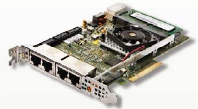
NT4E-4T: 4 x 1 Gbps PCIe